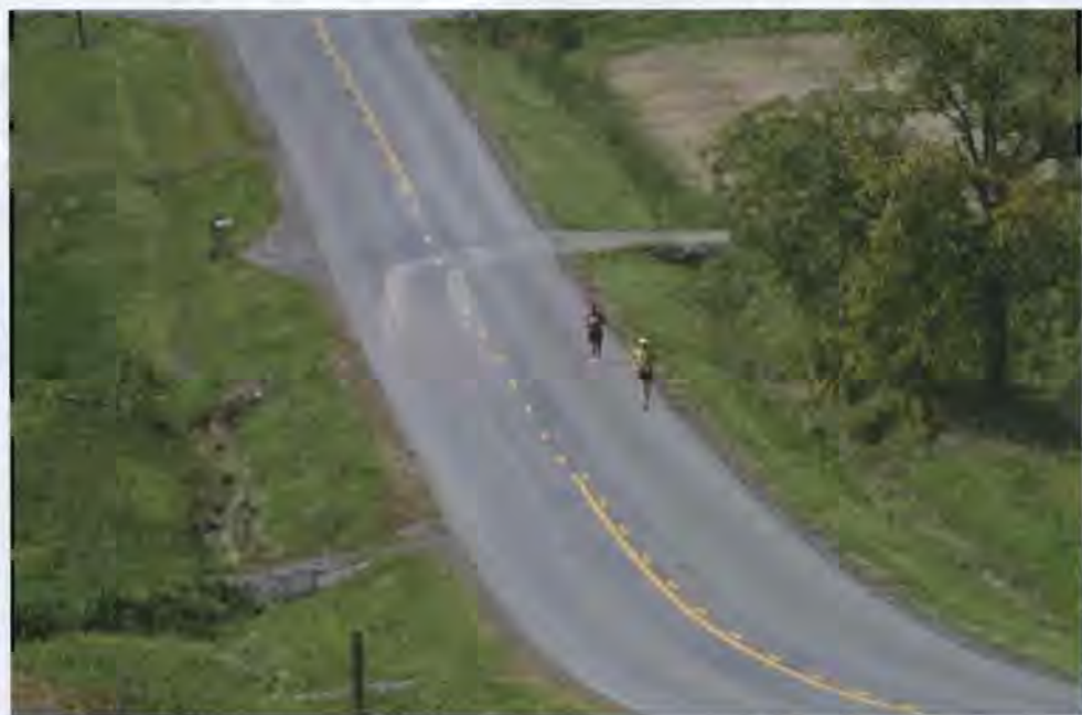
A beautiful sweep of road invites runners to pick up their pace, till they hit the hill

The beauty of the scenery and camaraderie of racers and volunteers offset the ache in my hips from pounding on asphalt at an off-kilter tilt due to running strictly on the left side of the road for miles on end. At some point midway, I switched on my iPod (I'm one of those runners) exclaiming, "A little less than a marathon to go!" Thank you, AC/DC.